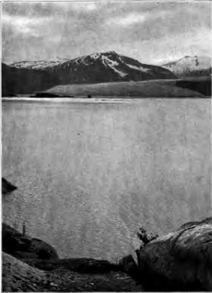
WINDOM GLACIER, TAKU INLET